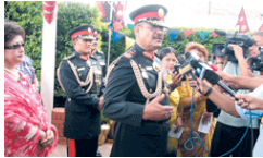
Chief of the Army Staff General Pyar Jung Thapa talking to journalists at Tribhuvan International Airport.