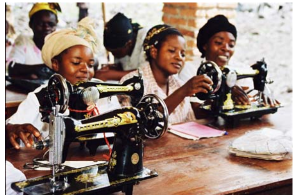
Women take part in the skills training of our partner organisation PAIF in DR Congo

Faced with economic hardship and grief for family members, most women in post-war countries need first and foremost the feeling of existential security. Only then can they start dealing with and overcoming the violence and horror of the war. Support in practical everyday life struggles is therefore placed at the onset of the psycho-social counselling and support of the women. Every project first seeks to secure the material security of its clients – either through medica mondiale itself or by referring them to other aid organisations. The women are supplied with food, blankets and clothes, and the medica mondiale staff help them to