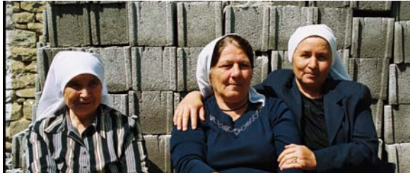
Women in Kosova still fighting for war pension

ground. Therefore, before a project is initiated, the extent, consequences and the specific perception of sexualised and other forms of violence against women and girls as well as existing support approaches in the region are discussed and analysed with key local organisations, groups and individuals. ■