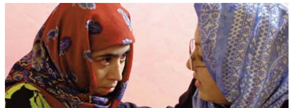
An Afghan psychologist provides women with support

Rape and other forms of violence have life-impacting consequences on a mental, physical, spiritual and social level. In addition, a feeling of shame, stigmatisation and the danger of being expelled from their own family