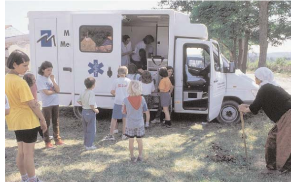
The mobile gynaecological ambulance of medica Kosova offers support in Kosovarian villages

Depending on the crisis context, the training level of the counsellor and the specific life situation of the affected woman, it can be possible to deal with traumatic experiences therapeutically – this can take months and years. The therapeutic process can lead to a healing result if the client is able to accept her traumatic experiences as part of her life experience and to develop a new perspective for her life. In this context, the official acknowledgement and prosecution of sexualised violence as a serious human rights violation is an important factor to re-establish justice for the survivors. ■